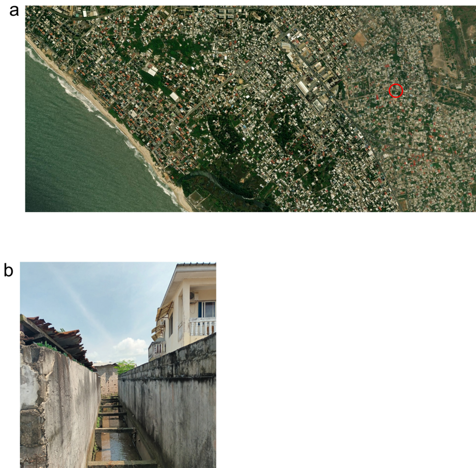
Fig. 1. Geographical overview and location of the sampling site in Pointe-Noire. (a) The sampling was performed within the red circle area and the map was obtained from the website https://www.mapnall.com/en/ . (b) photo of the gutter where water was sampled. (For interpretation of the references to color in this figure legend, the reader is referred to the web version of this article.)