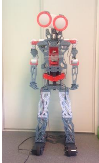
Figure 1. Meccanoid G15KS robot.

The presentation of stimuli and the registration of manual responses were controlled by E-prime software (version 2.0, http://www.pstnet.com/ ). Stimuli were green or blue solid circle ( 2 \times 2 cm, 1.9^\circ of visual angle), presented at 6.5 cm ( 6.2^\circ ) on the right or left side of the center of a 20-inches CRT monitor. Responses were recorded by means of a computer mouse located on the right of the monitor.