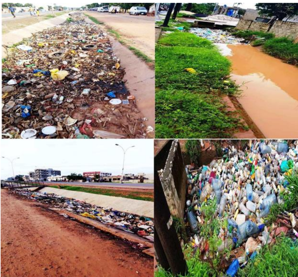
Figure 5. Wastewater and rainwater drainage channels blocked by rubbish on boulevard 54, Tilène, Corentas and Escale in Ziguinchor

flooding of surrounding neighborhoods such as Belfort. This situation is aggravated by the existence of an undersized and poorly maintained water drainage system often clogged with garbage and sand (Figure 5).