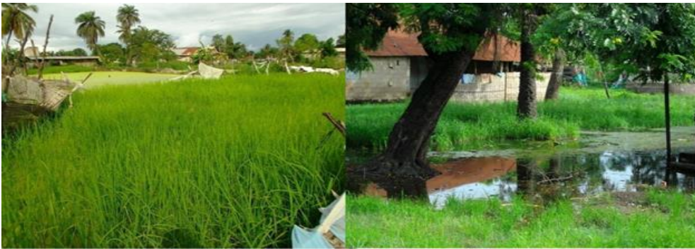
Figure 4. Peri-urban agriculture in Ziguinchor (cohabitation of houses with rice-growing plots) in the Lyndiane district

demographic growth thus leads to a lack of control over the spatial dynamics of the city. One of the important aspects to remember in this context is the dysfunctional use of space (Figure 4). The habitat is not welded in some places where the land under construction or not built becomes areas where water stagnates part or all of the year. These flooded areas increase the risks to health, safety and mobility. All these elements increase the city's vulnerability to flooding phenomena.