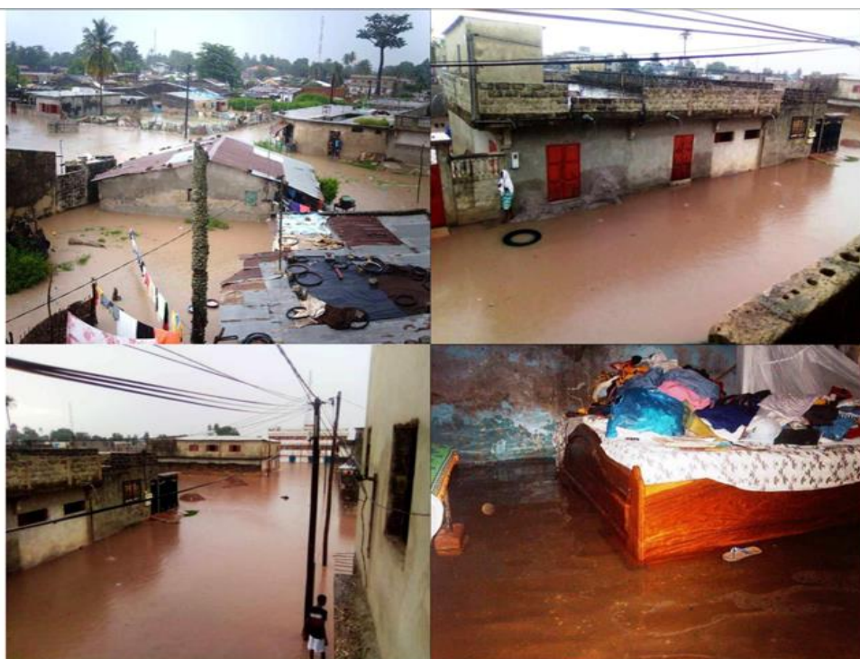
Figure 3. Flooded neighbourhoods in Boudody, Lindiane, Goumel and Belfort