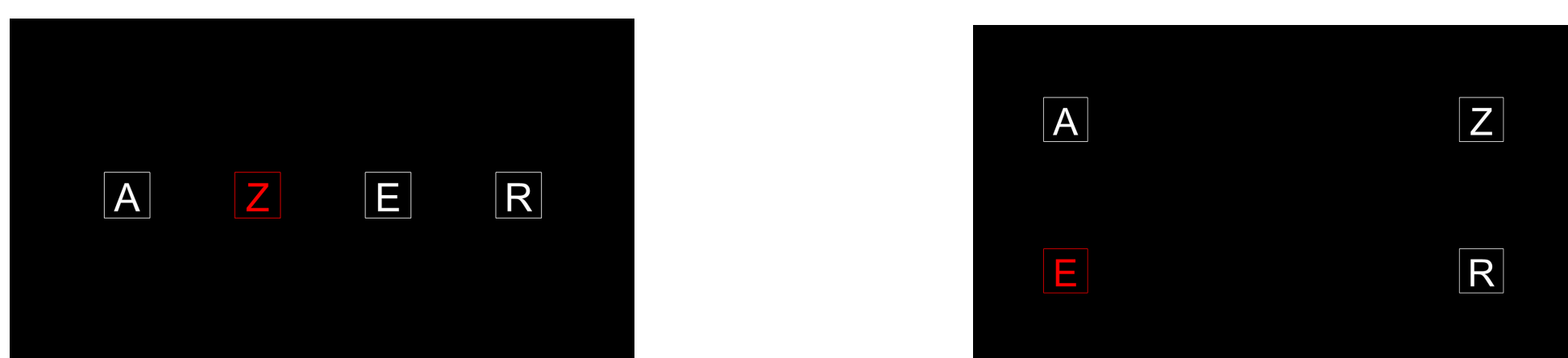
Fig. 3: Two display layouts tested. Target letter during the learning phase stays red for one second at the beginning of each trail.

A regularized Common Spatial Pattern algorithm and a regularized Linear Discriminant Analysis are trained to discriminate the frequencies.