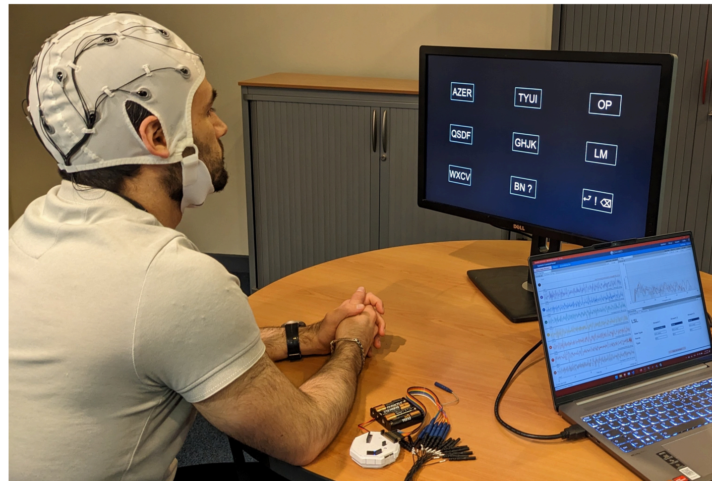
Fig. 1: Electrode layout of the OpenBCI's cap.