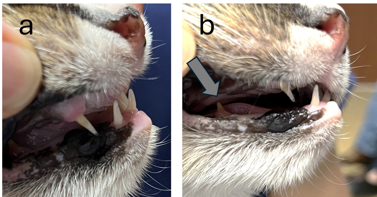
Figure 2. Abnormal dentition in the affected cat. Only the four canines and the two lower premolars with an abnormal, extremely pointed shape were present. The incisors, upper premolars and molars were missing. (a) Four canines are visible. (b) The right lower premolar is indicated with an arrow.

Blood hematology and biochemistry revealed only moderate eosinophilia and marked neutrophilic leukocytosis, probably secondary to chronic dermatopathy (Tables S2 and S3). Cushing syndrome was ruled out by abdominal ultrasonography, which revealed normal, normoechoic adrenal glands of normal size and shape, as well as normal blood and urine tests and a normal urine specific gravity of 1.050 (Table S4). FIV and FeLV tests were negative. The owner declined skin biopsies for further histopathological examinations.