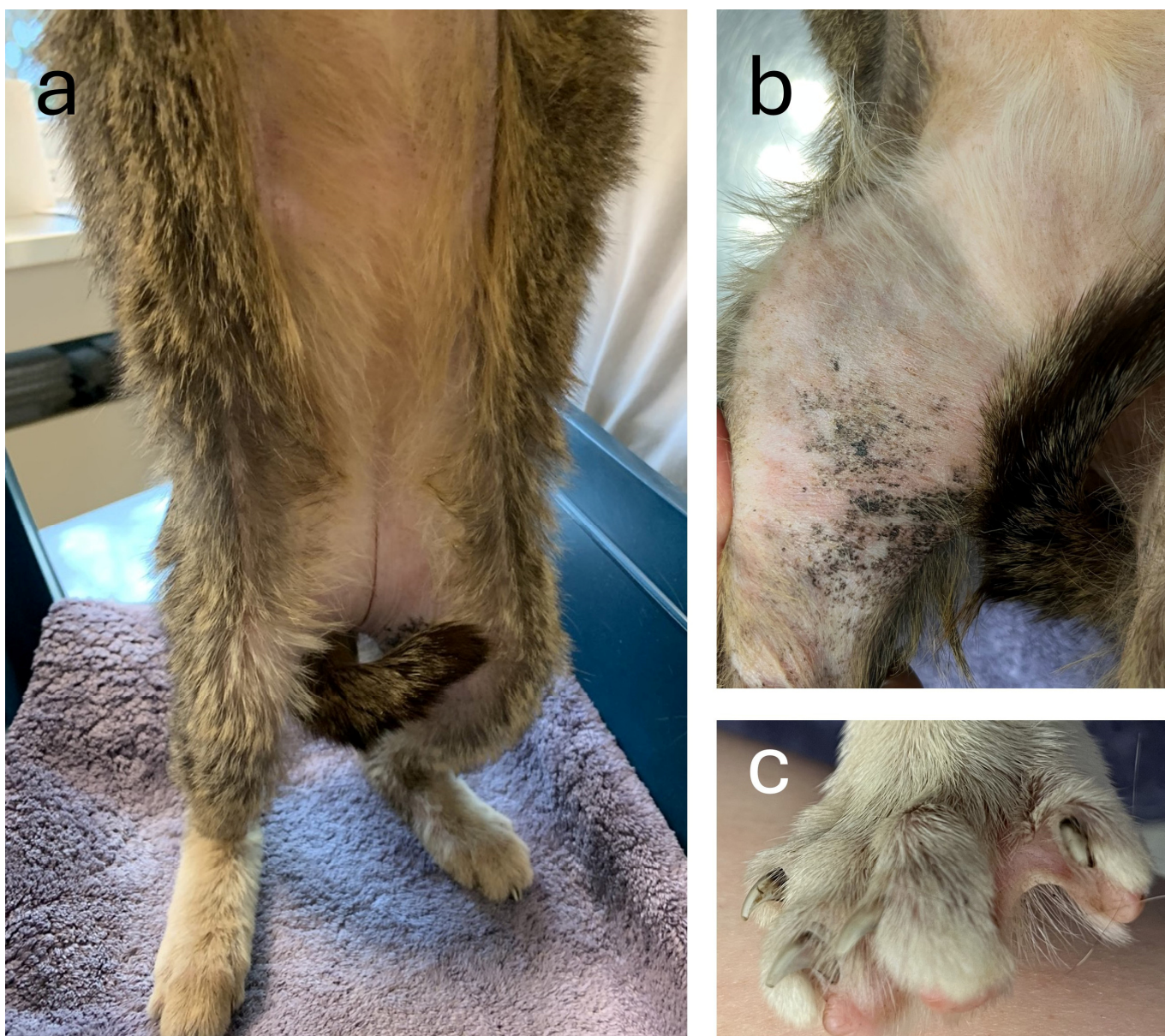
Figure 1. Diffuse hypotrichosis of the affected cat. (a) Complete abdominal alopecia and a lack of undercoat on the remaining haired skin. (b) Alopecia and hyperpigmentation of the inner thighs. (c) Alopecia of unguis ridges.

At the time of presentation, the cat had only six teeth, the four canines and two lower premolars. The incisors, upper premolars and molars were missing. The canines and the present premolars had an abnormal conical shape (Figure 2).