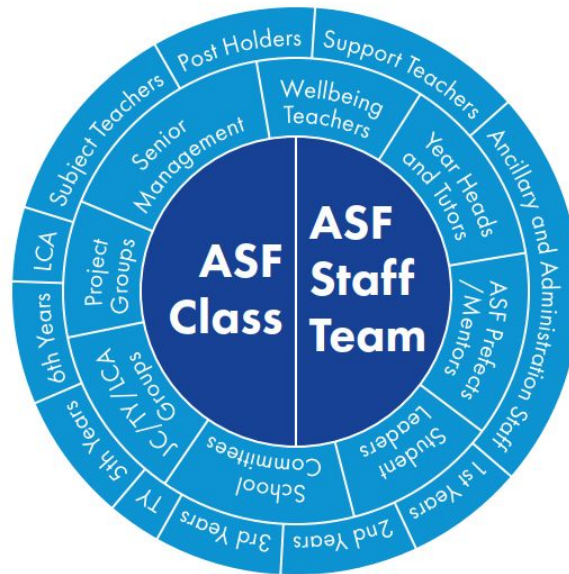
Figure 1. Diagram showing the key stakeholders involved in the ASF programme with the implementers at the center