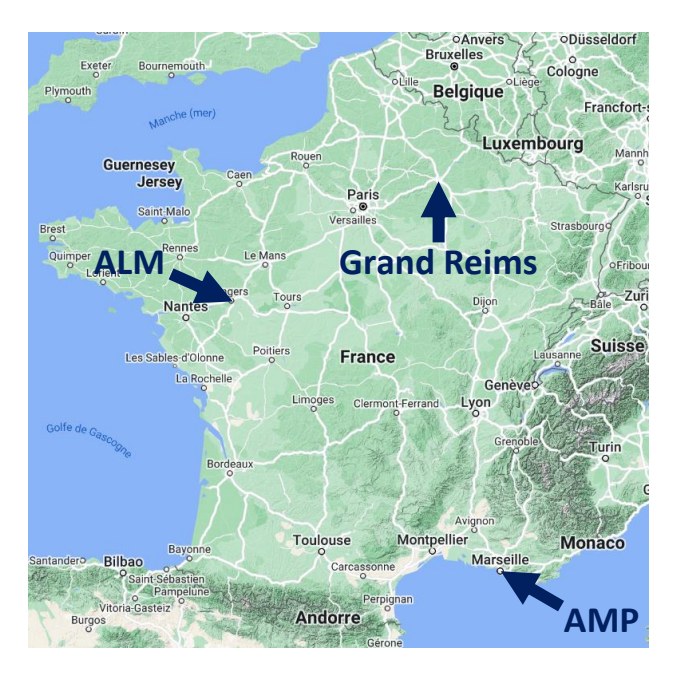
Figure 1: Location of the three local authorities that are included in the case study

Note: The ALM mobility plan is included in an urban land-use plan, so it has some specificities, especially considering that there is only one common SEA for both urbanism and mobility aspects.