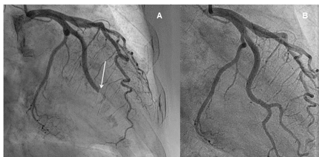
Fig. 1. An example of the angiographic aspect of Coronary artery Embolism. Coronary angiogram showing distal occlusion of the left circumflex branch (white arrow) (A). Normalization of coronary flow after thrombectomy without angioplasty or stenting (B).

pected to improve its identification. Most studies had a number of exclusion factors suggesting that the prevalence of CE may be underestimated, including (1) pathological evidence of atherosclerotic thrombus, (2) coronary artery ectasia, (3) plaque disruption or coronary erosion detected by intravascular ultrasound (IVUS) or optic coherence tomography (OCT) on the proximal site of the culprit lesion, (4) history of coronary revascularization, and (5) patients with \geq 25\% coronary artery stenosis outside of the culprit lesion on coronary angiography [7,8,10]. Underdiagnosing CE cases may also be due to additional factors such as the time between coronary angiography and clinical symptomatology; the anticoagulants and/or thrombolytic used for ischemic stroke, which can contribute to the dissolution of a coronary thrombus. Also, small size CE, which would not lead to STEMI, but which could be revealed by cardiac magnetic resonance imaging (CMR) with gadolinium injection and a late enhancement sequence analysis [11].