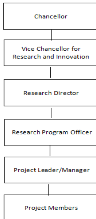
Fig. 4. Organizational Structure

At the University of Science and Technology of Southern Philippines (USTP), a state-owned university in Cagayan de Oro City, Philippines, a research team composed of three has project leader/manager that leads the drafting of institutional proposal in coordination with the Research Program Officer at the Research Office. If everything is in order, proposal is endorsed by the Research Director. Moreover, the Vice Chancellor for Research and Innovation recommends its approval after the Head of the Accounting Office signifies the available of funds. Finally, the Chancellor approves it. See Fig. 4 below.