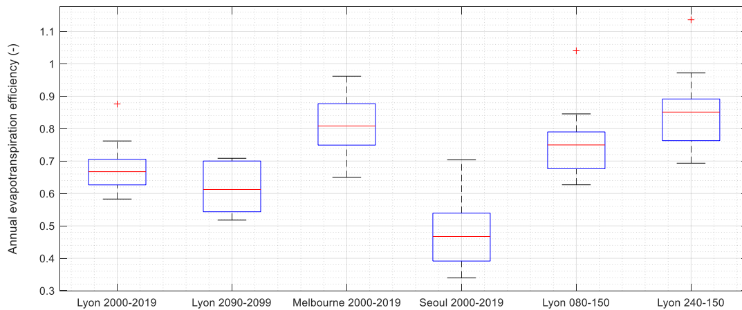
Figure 2. Box plot (with standard 1.5 IQR limits) of annual evapotranspiration efficiencies in Lyon 2000-2019, Lyon 2090-2099, Melbourne 2000-2019, Seoul 2000-2019 for a standard roof (substrate depth = 80 mm, underlying storage = 52 mm), and Lyon 2000-2019 for two other green roof designs (substrate depth = 80 mm, underlying storage = 150 mm and substrate depth = 240 mm, underlying storage = 150 mm).

In Lyon, the global simulated EE for the period 2000-2019 for a standard green roof (substrate depth = 80 mm, underlying storage = 52 mm) is 66.7%. The global EE is only 60.0% with the same roof for the future climate period 2090-2099. The box plot of the annual EE for both periods is shown in Figure 2. For the period 2000-2019, the annual EE varies from 58.3% to 87.6%. For the period 2090-2099, it varies from 51.8% to 70.8%.