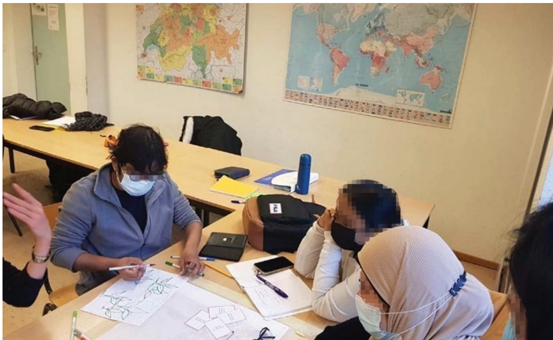
Figure 1. Facilitating the description of everyday places.

The following extracts emerged from the prompt “What heroic figure(s) live(s) in this area?”