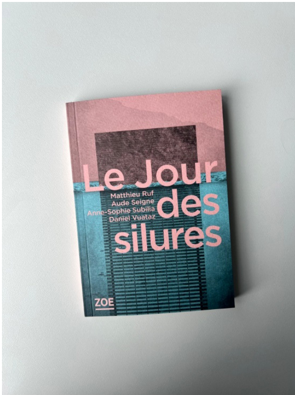
Figure 5. From narratives to a novel.

This novel was a means to challenge the story inherited from previous planning projects. What does rational planning mean when uncertainty becomes the new normal? What is left of a planned city when everything returns to a wild state? Some of the narratives collected from the inhabitants gradually took shape within the novelistic space, making room for places, objects, and symbols of everyday life in 2021–2022.