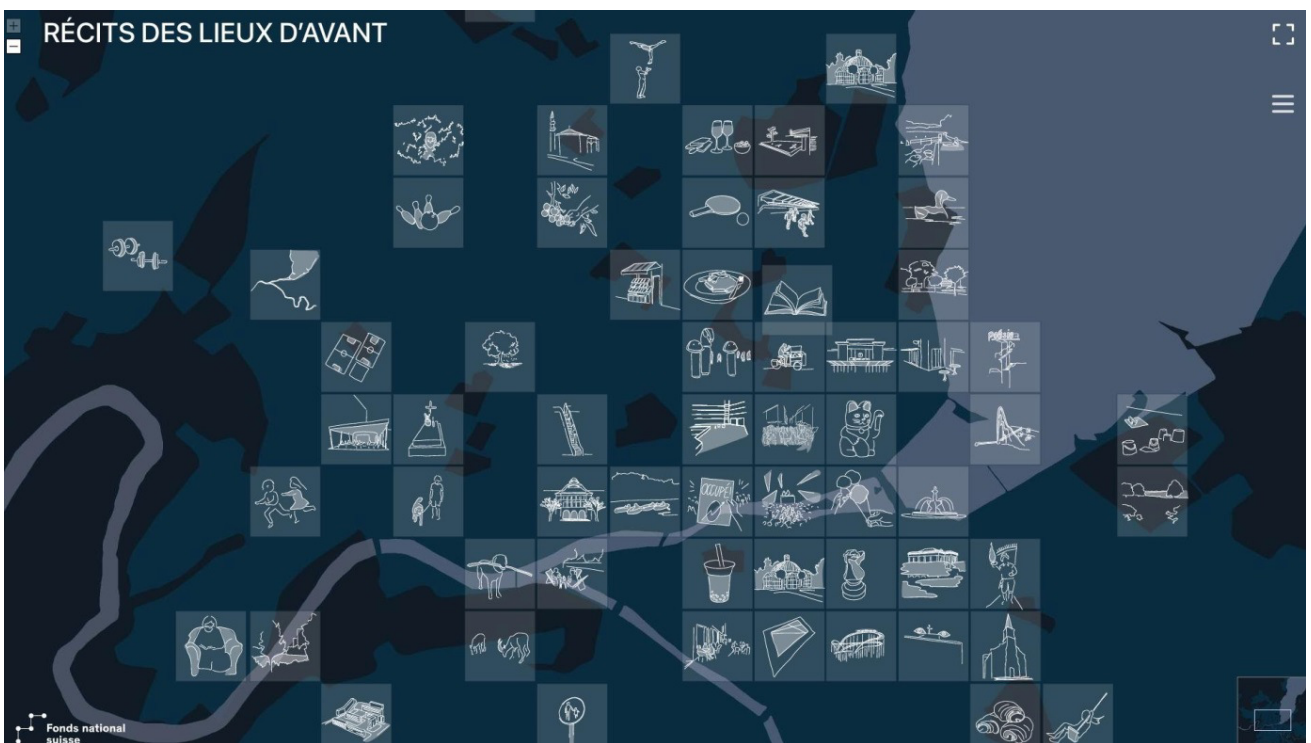
Figure 4. A possible map of places of attachment.

Meanwhile, the piece of fiction has developed into a novel titled Le jour des silures (“The Day of the Catfish”), published in May 2023 by Zoé (Figure 5). Its contemporary authors drew on all the material gathered during the writing workshops and encounters in the public space to create a polyphonic narrative.