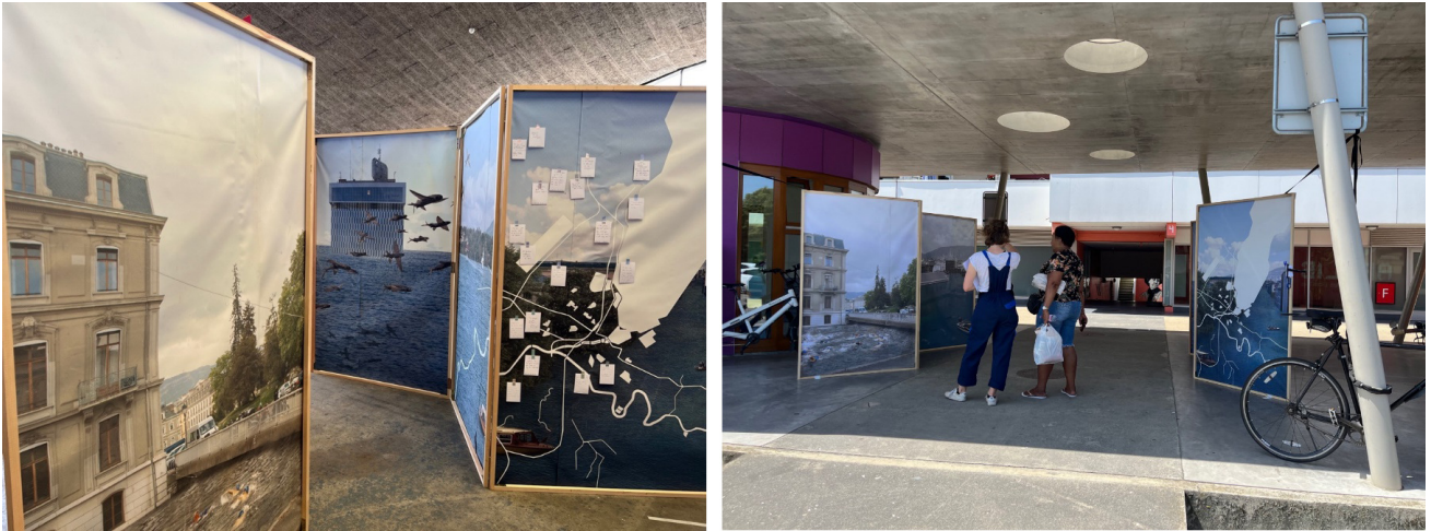
Figure 3. Returning to the workshop participants and asking questions to passers-by.

One hundred and eighty contributions were collected and then transcribed into a file and located on a map. From stories to anecdotes, this archive of places of attachment was growing. Fragments of a “lover’s discourse” (to play with the title of Roland Barthes’s famous work) were linked to places, which seemed to us to offer the possibility of drawing a subjective map of the region. The map produced would never stabilise. The narratives gathered the fiction that came out of them, and the resulting stories about places would potentially generate a constantly evolving geography of attachments (Figure 4).