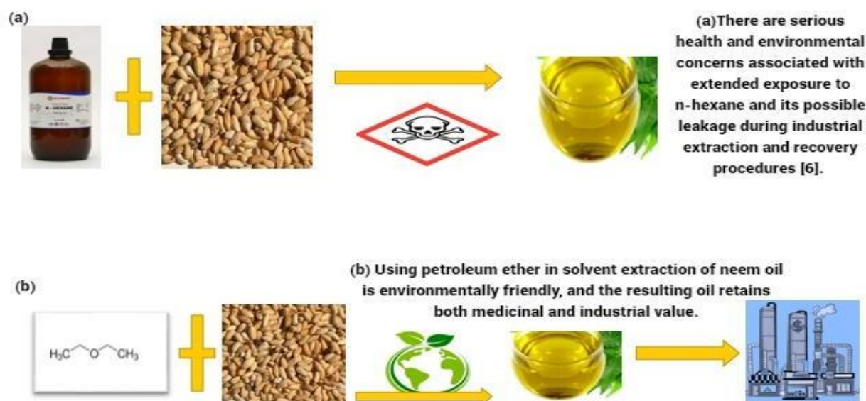
Figure 1: Petroleum Ether versus N-hexane Solvent Extraction

was utilized as an alternative to n-hexane in this research, offering a promising and safer extraction method (Figure 1b).