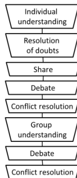
Fig. 2. Reaching shared understanding of the scenarios

aims to standardize the concepts and/or terms so that everyone can understand the same thing without using the same words that may have different meanings/interpretations (i.e., homonyms) or using different words for actions, elements, or situations that mean the same thing (i.e., synonyms). It is important to consider that this type of event also occurs because, in the previous step, to make the descriptions of the steps richer, a group of people with different backgrounds and points of view is involved, which generates different interpretations, perceptions, ideas that must be homogenized so that there are even understandings. The idea is that at the end of this step, the previously defined scenarios can be understood, thus generating a consolidated group of scenarios that everyone understands and that, subsequently, the actions to be taken can be determined based on decision-making management.