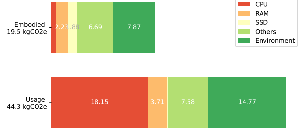
Figure 3: GWP impact of a cloud instance hosted in France with 4 vCPUs, 8 GB of vRAM and 80 GB of SSD storage used for a year, calculated using Equation 10

Equation 10 allows to obtain the instance embodied and usage impacts for an hour, each share is multiplied by the cloud platform total impacts for the resource ( \mathcal{F}_r ). This assumes that the server