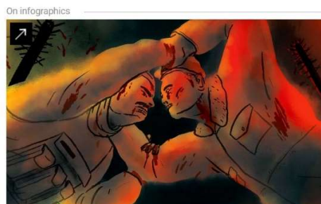
Tap to launch this special feature India-China border clash explained

New policies may find space for Sino-Indian joint ventures and return the Line of Actual Control to the pre-2020 status quo. Concessions from both sides would provide stability and predictability.