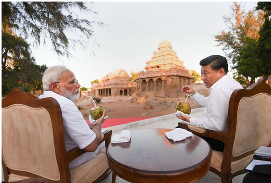
Indian Prime Minister Narendra Modi and Chinese President Xi Jinping chat during their informal summit in Mamallapuram, India, on October 11, 2019.

India's latest election marked a resurgence of democracy, as voters pushed back against concentrated power and the ethno-nationalist sentiments in the ruling Bharatiya Janata Party. This shift may force Prime Minister Narendra Modi to reconsider his hardline policies and opt for more cautious approaches. Implemented wisely, such changes could bolster India's international standing.