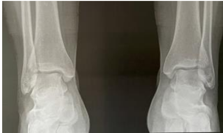
Fig. 3. Absence of polycystic lesions in X-Ray

This is suggested by the observation of free fat droplets released from disrupted fat cells, processed by macrophages in connection with a histiocytic infiltrate [8–11].