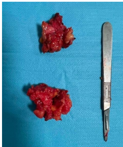
Fig. 1. Resected Specimen

It is a rare hereditary condition with autosomal recessive transmission, caused by a mutation in the TYROBP or TREM2 genes. These genes are involved in the regulation of immune responses, the differentiation of dendritic cells and osteoclasts, and the phagocytic activity of microglia [3–5].