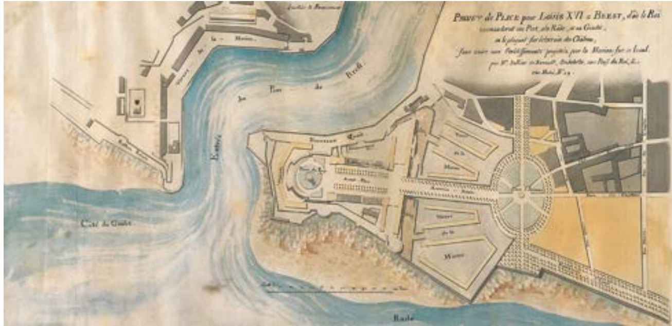
← Fig. 4: Claude Jean-Baptiste Jallier de Savault, Unrealized project for a Place Louis XVI, from which the King would control the port, the roadstead and the Goulet by placing it on the grounds of the château, without harming the establishments planned by the Navy on the site, plan, about 1785, Musée des Beaux-Arts de Brest métropole.