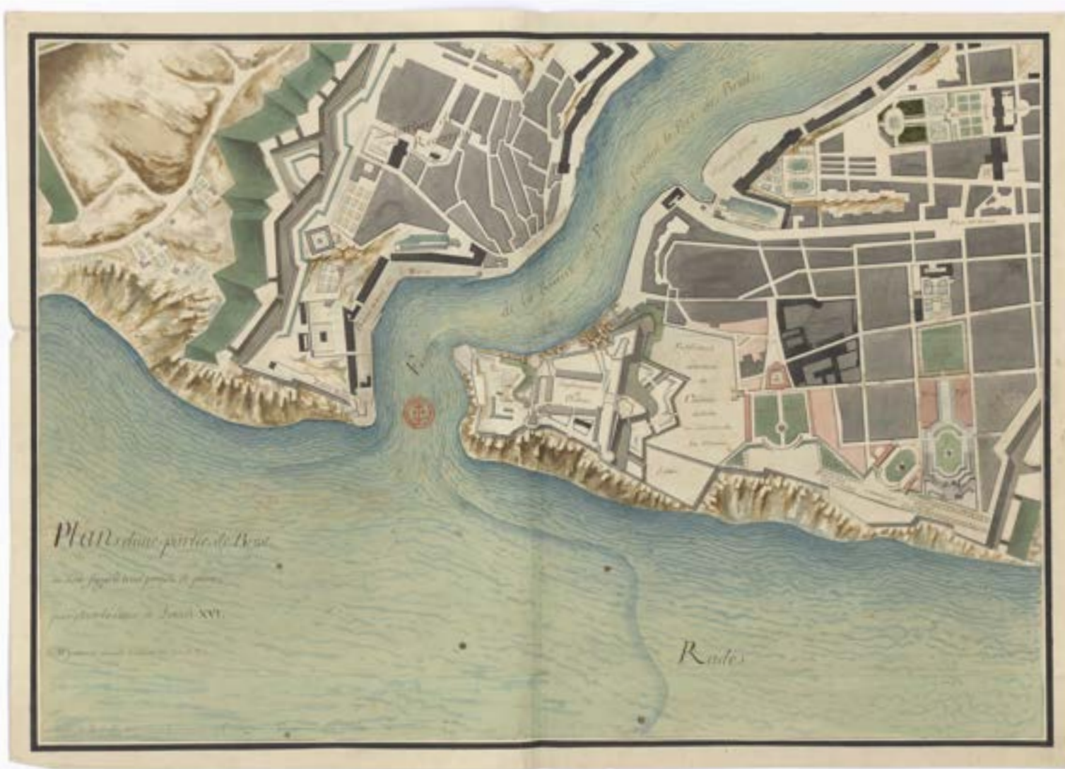
Fig. 3: Claude Jean-Baptiste Jallier de Savault, Plan of part of Brest showing three proposed locations for the statue of Louis XVI, 1785