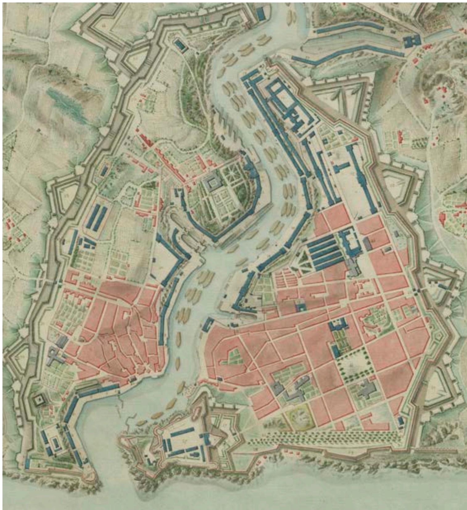
Fig. 1: Camus, Map of Brest and Recouvrance, 1782, source: Paris, BnF, Maps and Plans department.