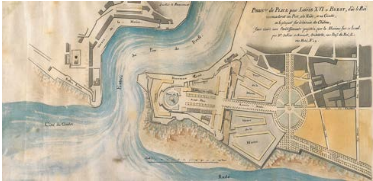
← Fig. 4: Claude Jean-Baptiste Jallier de Savault, Unrealized project for a Place Louis XVI, from which the King would control the port, the roadstead and the Goulet by placing it on the grounds of the château, without harming the establishments planned by the Navy on the site, plan, about 1785, Musée des Beaux-Arts de Brest métropole.