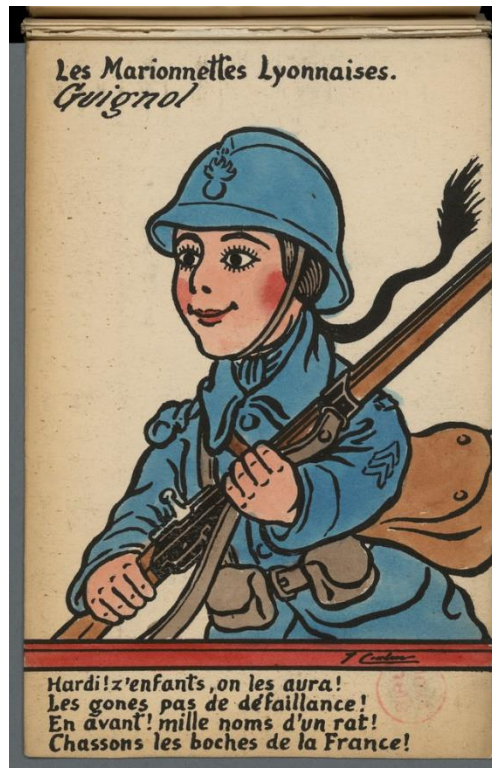
Figure 1. Luc Mégret. “Guignol Poilu” (1918). Drawing for the book cover of Artistique-Revue , 1918. Image in the public domain.

Even in Lyon, this transformation of a local figure into a national hero could be perceived—for example when Guignol, Gnafron, and Madelon, singing the military march Le Régiment de Sambre-et-Meuse in the play La Fin de la guerre (The End of War) by Grandjean (1916), identified themselves as “ fiers enfants de la Gaule ” (Proud Children of Gaul) (15).