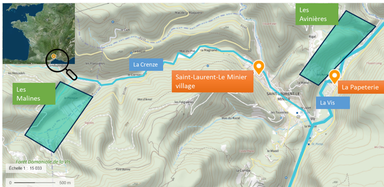
Fig. 1 Localisation of Saint-Laurent-Le Minier and its former mining sites. The background map comes from géoportail.

While there is current advocacy for mining renewal, acknowledging its necessity in the face of challenges posed by