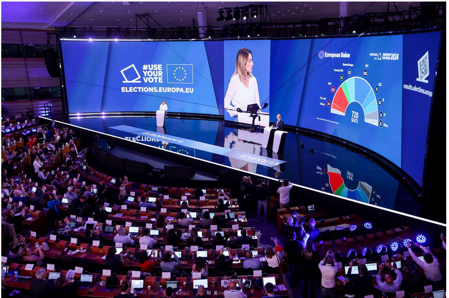
Parliament President Roberta Metsola during election night at the European Parliament in Brussels.

Indeed, the decline of the centrist Renew, traditionally supporting mainstream parties (EPP & S&D), signals uncertainty in major decisions. This particularly pertains to immigration policies and the “green deal,” already under heightened scrutiny from citizens, businesses, agriculture, and the political factions that spearheaded these initiatives, hinting at inevitable repercussions.