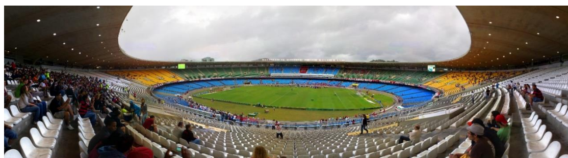
Figure 4. The Maracanã refurbished for the 2007 Pan American Games.

There were 30,000 standing places at [1 to 2 euros] depending on [the] match. The price was considered fair because the view wasn't very good and there was no comfort. But there was no violence, even though opposing fans were side by side (Asberg et Martins, 2015).