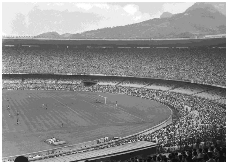
Figure 2. The original Maracanã.

For 50 years, the stadium was structured around three main areas (fig. 2): the upper ring (concrete bleachers); the middle ring (seats and boxes); and the lower ring, known as the Geral (standing areas surrounding the pitch, allowing fans to circulate freely and form a compact mass just above the pit).