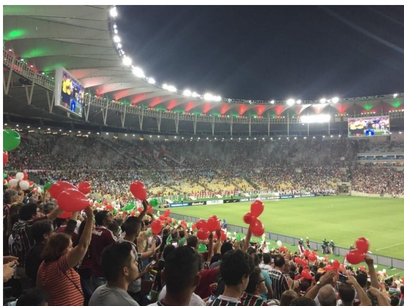
Figure 8. One stadium, two atmospheres.

recognized by IPHAN (in its listing of the Maracanã stadium) as being of high cultural, heritage and political value. These different ambiances testify to a new partitioning of the Maracanã stadium' space. The North and South sectors are occupied by active and politicized club fans who are critical of the club's marketing strategies. The East and West sectors, on the other hand, are mostly occupied by new, younger, more feminine, and perhaps more docile fans, the behavior of whom the operators seek to shape to their advantage.