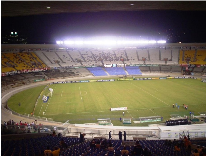
Figure 3. Maracanã before its refurbishment in 1999.

Rio was awarded the right to host the 2007 Pan-American Games, which led to further renovations. Parts of the restructuring were well received by the public (Ferreira, 2017): lowering of the pitch surface; expansion of parking areas, cloakrooms, and toilets; and so on. On the other hand, the addition of 28,000 seats to develop the blue sector (fig. 4), at the detriment of the Geral zone and covered seats, angered those who used to occupy these areas. The Geraldinos , as they are called, saw themselves as creators of ambiance. Positioned very close to the coach's bench, some even thought they could influence his choices (Asberg et Martins, 2015). These renovations reduced the freedom of movement - seen as cultural heritage - in this highly original section of the stadium. For reasons of comfort and safety, the capacity has been reduced (national competitions: 100,000 seats; international matches: 80,000), mainly due to the elimination of the standing area. But, without the Geral , the intensity of the ambiance has been reduced, due a loss of freedom of movement and price increases aimed at attracting less fervent middle-class audiences: the maximum ticket price