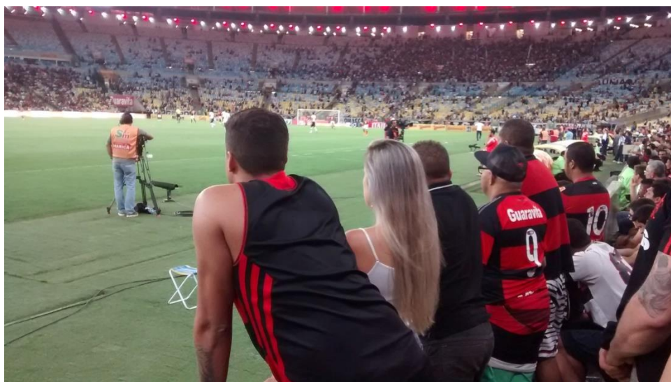
Figure 7. Pós-geraldinos standing near the ground.

Another micro-ambiance is created by the post-geraldinos , one of the five sub-categories of artist-supporters in Ferreira's taxonomy (2017). Nostalgic of the Geral era, when people could roam at will near the pitch, they make their presence felt by leaning towards the pitch - an impressive sight when large numbers of fans do so - to cheer their team or berate its opponents(fig. 7).