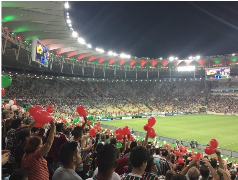
Figure 8. One stadium, two atmospheres.

recognized by IPHAN (in its listing of the Maracanã stadium) as being of high cultural, heritage and political value. These different ambiances testify to a new partitioning of the Maracanã stadium' space. The North and South sectors are occupied by active and politicized club fans who are critical of the club's marketing strategies. The East and West sectors, on the other hand, are mostly occupied by new, younger, more feminine, and perhaps more docile fans, the behavior of whom the operators seek to shape to their advantage.