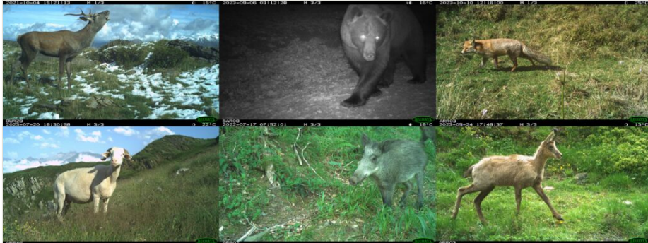
Figure 2. doi

Although the raw data (pictures) are not made available and since these data might be useful to some projects (e.g. species recognition software), it is possible to contact us to obtain the pictures, which are sorted by camera trap and by time period. See below for an example of pictures (Fig. 2).