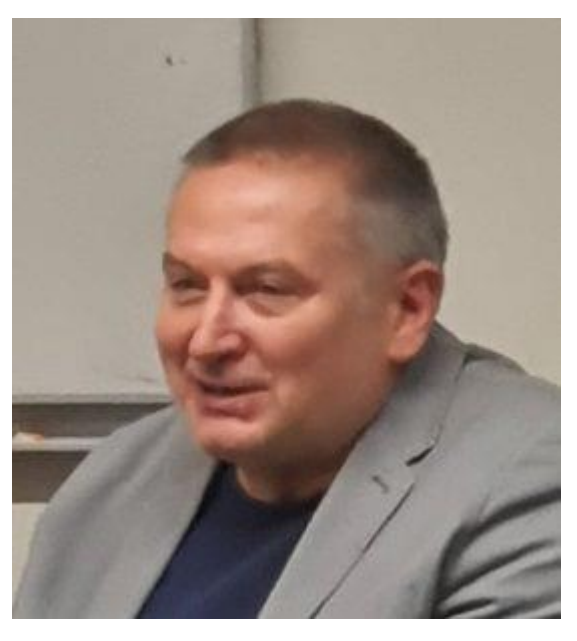
a few years ago.