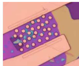
Figure 2. Microscope image of a field effect graphene transistor from [4]. The transistor channel, in between two gold electrodes, is partially covered in small gold disks that are essential for near-field infrared spectroscopy.

we use our recently developed infrared spatial modulation spectroscopy method [1–3] to show that the spectra of the emission exhibit the spectral signature of hyperbolic phonon polaritons of hBN, excited by the electroluminescence in graphene. The amplitude of this feature is such that it largely exceeds that of incandescent emission from hBN.