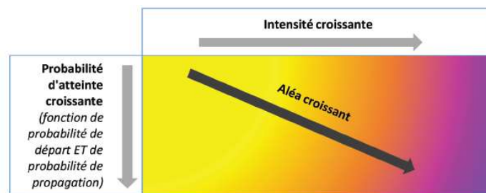
Figure 1. Définition of hazard in the MEZAP

The method is founded on the following principles: characterizing rockfall hazard within MEZAP involves an intersection of the intensity of a rock mass mobilization event and the probability of this mass reaching a specific point on the territory.