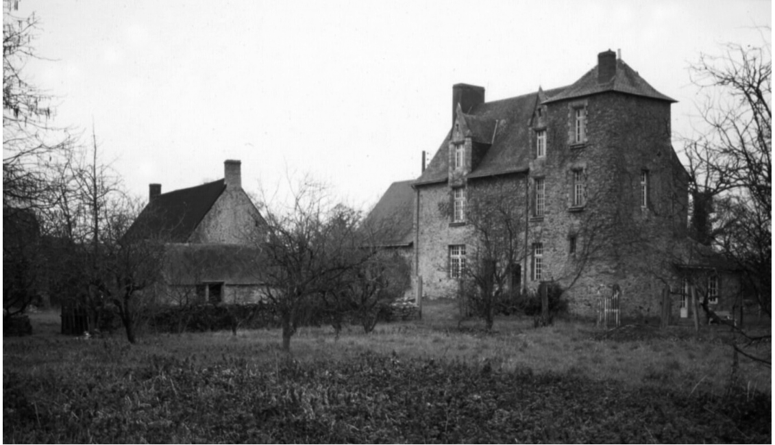
FIGURE 5.1. The métairie of Châtelier (Mayenne) in 1998.