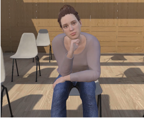
Figure 1: Screenshot of the final position of an animation showing the female virtual character displaying an head tilted, fist under chin, torso leaning forward, no facial expression and a gaze facing the speaker (Til_For_Chi_NoE_look (23)).

can have an impact on the perception of the character's social attitude and that the impact of these variables will therefore have to be investigated in more detail in future work [5, 30].