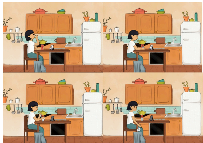
Figure 1: Example arrays from the visually animated video clips for story number 1 (“Zeynep is in the kitchen, she pours juice, she tears up the photo...”).

Procedure The stimuli were programmed using the Gorilla.sc platform (Anwyl-Irvine et al., 2020). Four condition manipulations were made: in Witnessed_Truth and Witnessed_Lie conditions the participants were presented with the story as silent animated videos, whereas in the Reported_Truth and Reported_Lie conditions, the participants listened to the auditory reports of the mini-stories where the actual action was not visually witnessed. This way, we manipulated the source of information as perceived by the participant (witnessed vs. non-witnessed) and the truth status of the story retell (lie vs. truth).