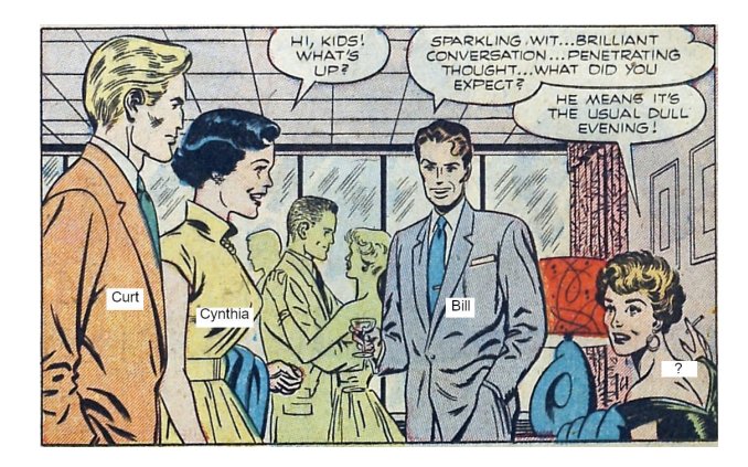
Fig. 2. Panel 5 of page 12 from Boy Loves Girl 41 [10] with identified character's names inserted over corresponding characters.

position them carefully, ensuring that important details like facial expressions are not hidden. Our proposal is to centre them on the detected body.