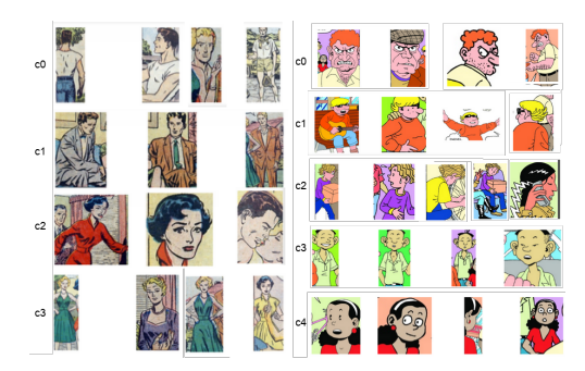
Fig. 3. Example of character clustering output: four and five clusters computed for "Escape with me" (left) and "Patents" (right) respectively.

error propagation, we assume that characters have been detected by any dedicated algorithm from the literature (see Section 2.2) and errors are manually curated if needed. Character crops with significant overlap of multiple character have been discarded to avoid confusion in image feature vector computation and clustering. For image feature extraction (embedding), we used CLIP ViT-L/14 model trained with the DataComp-1B<sup>8</sup> and original hyperparameters similarly to [11,39]. We varied the minimum cluster size UMAP parameter from 3 to 10 without any notable impact on the final classification. This might be due to the simplistic style of images, we will extend this evaluation to other styles in the future. We reduced the minimum number of element by cluster of HDBSCAN algorithm to 5 for both titles because of the limited number of pages. Anyway, the algorithm grouped more than 12 instance for each cluster in our experiment, so no impact has been observed. Fig. 3 shows cluster result samples of the groups automatically formed by HDBSCAN plus an extra one (misc) not shown in the figure but detailed in Table 2. All clustered images are provided here<sup>9</sup>.