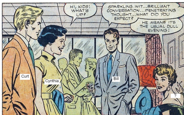
Fig. 2. Panel 5 of page 12 from Boy Loves Girl 41 [10] with identified character’s names inserted over corresponding characters.

position them carefully, ensuring that important details like facial expressions are not hidden. Our proposal is to centre them on the detected body.