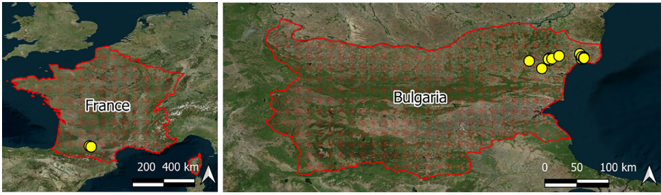
Fig. 1. The location of study fields (yellow dots) where the in-situ crop phenology stages were determined and acquired. Background - google satellite image.