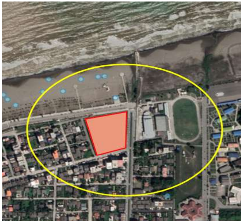
Figure 1 :Project location

The project has been located in Nowshahr city which is one of the cities of Mazandaran province in IRAN. This city is bounded by Caspian Sea from the north, Alborz mountain ridge from the south, Nur city from the east and Chalus city from the west. In terms of geographic location, Nowshahr is located at 36 degrees 39 minutes' north latitude and 51 degrees 33 minutes' east longitude, which is connected to the Caspian Sea from the north, Alborz mountain range from the south, Nur city from the east, and Chalus city from the west, generally the western part of the province. Mazandaran has a moderate and humid climate, and the mountainous regions of the western part of the province, including Nowshahr and Chalus, have a cold and humid climate. The amount of rainfall and air humidity in the west of the province is higher than in the east. The winds that blow to this region from the west and Gilan province make the air cold and cause snow to fall in the mountains. Nowshahr is one of the coastal, port and tourist cities of the province. Cumulative rainfall in the month of February in Mazandaran province shows that the highest amount of cumulative rainfall is from the west coast of Nowshahr to the east coast Tenkaben, it was between 105 and 180 mm. The city of Nowshahr has relatively high humidity, rain falls on the people of this region on most days of the year. The average annual rainfall of Nowshahr was recorded as 613 mm.