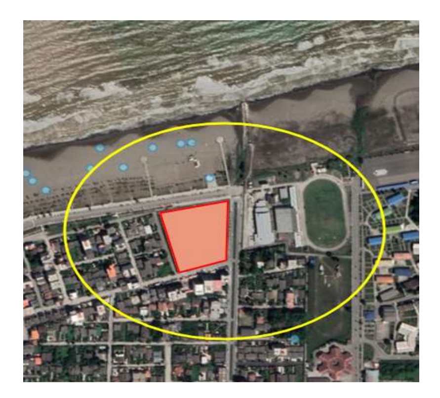
Figure 1 : Project location

The project has been located in Nowshahr city which is one of the cities of Mazandaran province in IRAN. This city is bounded by Caspian Sea from the north, Alborz mountain ridge from the south, Nur city from the east and Chalus city from the west. In terms of geographic location, Nowshahr is located at 36 degrees 39 minutes' north latitude and 51 degrees 33 minutes' east longitude, which is connected to the Caspian Sea from the north, Alborz mountain range from the south, Nur city from the east, and Chalus city from the west, generally the western part of the province. Mazandaran has a moderate and humid climate, and the mountainous regions of the western part of the province, including Nowshahr and Chalus, have a cold and humid climate. The amount of rainfall and air humidity in the west of the province is higher than in the east. The winds that blow to this region from the west and Gilan province make the air cold and cause snow to fall in the mountains. Nowshahr is one of the coastal, port and tourist cities of the province. Cumulative rainfall in the month of February in Mazandaran province shows that the highest amount of cumulative rainfall is from the west coast of Nowshahr to the east coast Tenkaben, it was between 105 and 180 mm. The city of Nowshahr has relatively high humidity, rain falls on the people of this region on most days of the year. The average annual rainfall of Nowshahr was recorded as 613 mm.