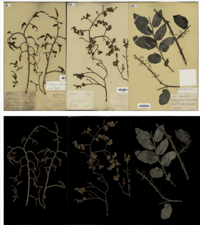
Figure 3. Examples of image segmentation.

Our approach removes the background noise from herbarium scans and extracts clean plant images. It is an important step before using these images in different deep learning models. However, the quality of the extractions varies depending on the quality of the scans, the condition of the specimens, and the paper used. For example, extractions made from samples where the color of the plant is different from the color of the background were more accurate than extractions made from samples where the color of the plant and background are close. To overcome this limitation, we aim to use some of the obtained extractions to create a training dataset, followed by the development and the training of a generative deep learning model to generate masks that delimit plants.