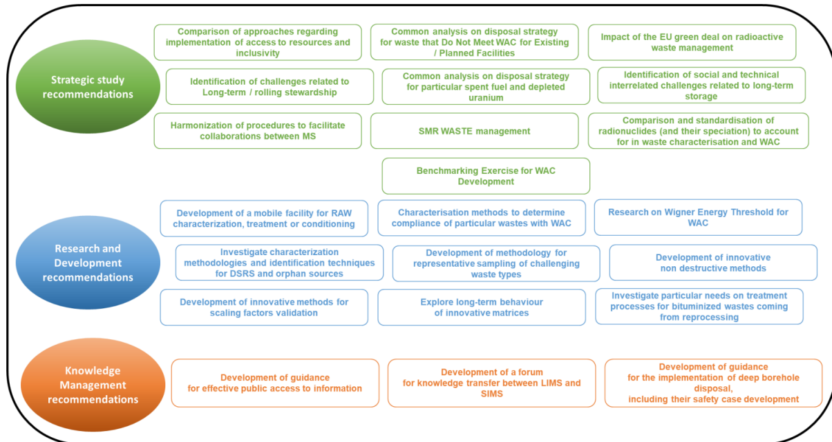
Figure 2. Overview of Recommendations Identified During the ROUTES Project.

Those recommendations are divided into seven topics: interactions with civil society & safety culture, international cooperation, disposal strategies, concept selection, development of Waste Acceptance Criteria (WAC), characterization and treatment & conditioning.