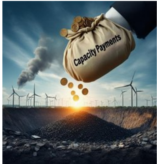
Figure 1: After document 118.

Thirdly, the capacity payment is an administratively fixed constant for all China, between 100 yuan and 165 yuan. This does not adapt to the local balance between capacity supply and need. This is less efficient than a system with locational pricing to reflect the limitations on the transmission system, such as the Pennsylvania-New Jersey-Maryland (PJM) capacity market. If capacity