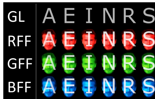
Figure 1. Stimuli used for each condition in the present experiment: grey letters (GL), semi-transparent grey letters with a red famous face (RFF), semi-transparent grey letters with a green famous face (GFF), and semi-transparent grey letters with a blue famous face (BFF). Due to copyright restrictions, David Beckham’s face shown in the figure has been pixelated, unlike in the experiment.