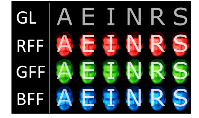
Figure 1. Stimuli used for each condition in the present experiment: grey letters (GL), semitransparent grey letters with a red famous face (RFF), semi-transparent grey letters with a green famous face (GFF), and semi-transparent grey letters with a blue famous face (BFF). Due to copyright restrictions, David Beckham's face shown in the figure has been pixelated, unlike in the experiment.