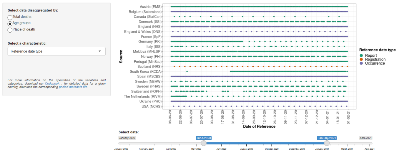
Figure 2: Screen shoot of the database online application allowing to browse the available data and metadata

Data source: the Demography of COVID-19 deaths (2020). French Institute for Demographic Studies - INED (distributor). Extracted from: https://dc-covid.site.ined.fr/en/data/pooled-datafiles/ (last data update: 22/04/2021)