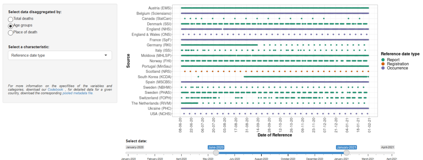
Figure 2: Screen shoot of the database online application allowing to browse the available data and metadata

This application allows to explore the data available on the website: 'the Demography of COVID-19 deaths' according to the metadata characteristics Data source: the Demography of COVID-19 deaths (2020). French Institute for Demographic Studies - INED (distributor). Extracted from: https://dc-covid.site.ined.fr/en/data/pooled-datafiles/ (last data update: 22/04/2021)