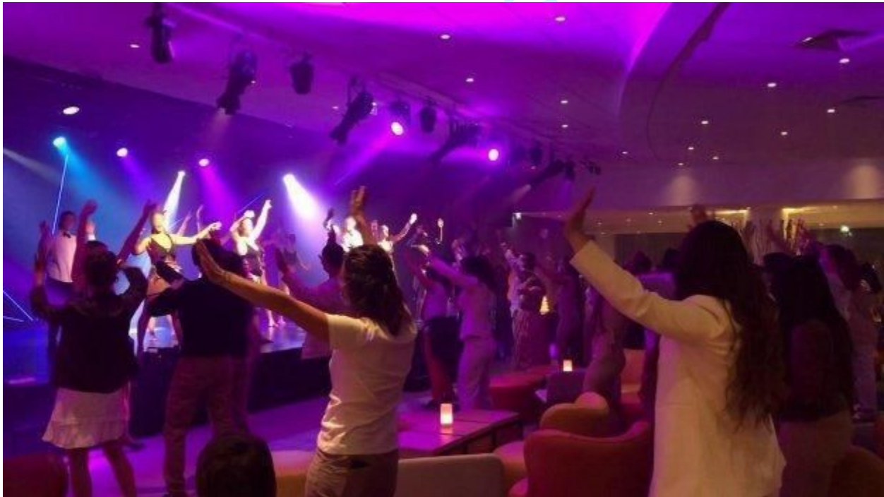
Figure 1: The “Crazy Signs”

Effervescent gatherings are moments of heightened enthusiasm and shared engagement in which actors align their movements and emotions. A contribution of our research is to show how these large gatherings energize FLEs, not just customers. Take, for instance, the iconic Club Med ritual called “Crazy Signs.” Performed every evening after the show, Crazy Signs are easy-to-follow choreographies led by a group of GOs, danced—and often also sung—to international pop hits. Figure 1 shows a picture of this ritual: GOs on stage raising their arms while energetically performing, commanding the attention of the GMs before them. The image captures a moment of dynamic interaction and shared mutual focus.