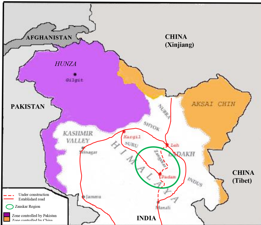
FIG. 1 : ZANSKAR REGION, LADAKH.

Zanskar valley in the Indian Himalayas is at a turning point in its history. After centuries of Buddhist-Muslim marriages, these are now rejected by both religious groups. This paper addresses the impact of the rise of religious fundamentalism on social regulation and communal negotiation in Padum and Zanskari society. This is a Tibeto-Burman speaking Himalayan population made up of a majority of Mahayana-Buddhists and a minority of Sunni-Muslims. Based on ethnographic research conducted since 2001 in the local language, the anthropological approach presented here emphasizes the importance of speech acts and also uses a socio-cultural and psycho-sociological perspective. It stresses historical and bibliographical investigations as well as research on the latest local political developments.