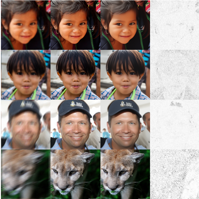
Fig. 2. From left to right: measurement, true image, MMSE estimate, pixel-wise 90% credibility intervals. From top to bottom: Gaussian blur, motion blur, superresolution. The first three and the last images are from the FFHQ and Imagenet data sets, respectively.