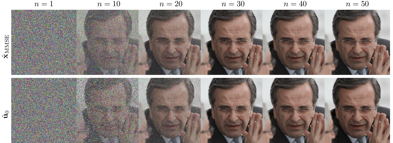
Fig. 4. Top: estimate \hat{\mathbf{x}}_{\text{MMSE}} as a function of the number n of Gibbs iteration. Bottom: estimate of the denoised image \hat{\mathbf{u}}_0 \triangleq \mathbb{E}[\mathbf{u}_0 | \mathbf{x}^{(n)}] produced by the DDPM (approximated by Monte Carlo integration).

dozen times per iteration of PnP-SGS (for about a hundred iterations). This finding should be mitigated by the fact that the efforts dedicated by different research groups to optimize their respective models are not comparable. Yet, the price to pay to get quantified uncertainties sounds very reasonable. It is worth noting that using a DDPM-based PnP with SGS significantly reduces the number of iterations required by the sampler to reach the steady regime, which explains the reduced computational cost with respect to SPA.