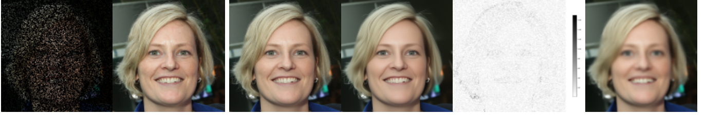
Fig. 3. Image inpainting, from left to right: measurement, true image, MMSE estimate \hat{\mathbf{x}}_{\text{MMSE}} , MMSE estimate \hat{\mathbf{z}}_{\text{MMSE}} , pixel-wise 90% credibility intervals, averaged samples generated by MCG [48]