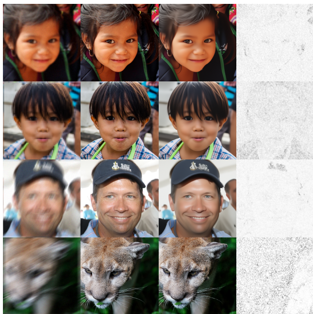
Fig. 2. From left to right: measurement, true image, MMSE estimate, pixel-wise 90% credibility intervals. From top to bottom: Gaussian blur, motion blur, superresolution. The first three and the last images are from the FFHQ and Imagenet data sets, respectively.