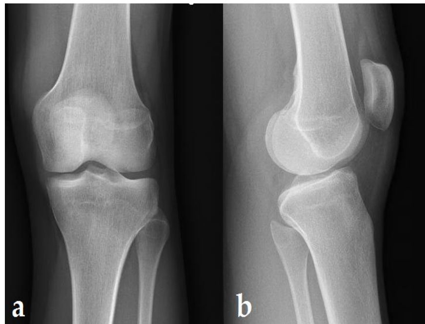
Figure 3. Standard X-rays: 4 months after the last US therapy. AP (a) and lateral view (b) showing no bone lesion.