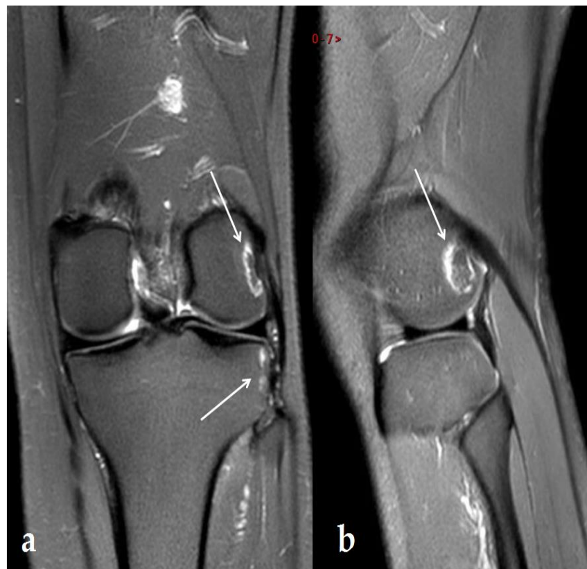
Figure 4. MRI: 6 months after the end of US therapy. DP FS MRI image in frontal (a) and sagittal (b) sections showing a reduction in lesions of the lateral femoral condyle, lateral tibial plateau, and head of the fibula with a sinuous cortical-to-cortical necrotic-like demarcation border in DP FS hypersignal 6 months after the US stopped. An 11 \times 11 \times 8 mm lesion remained on the femur and a 14 \times 14 \times 8 mm lesion on the tibia, but there was complete disappearance on the fibula. Arrows show lesion.