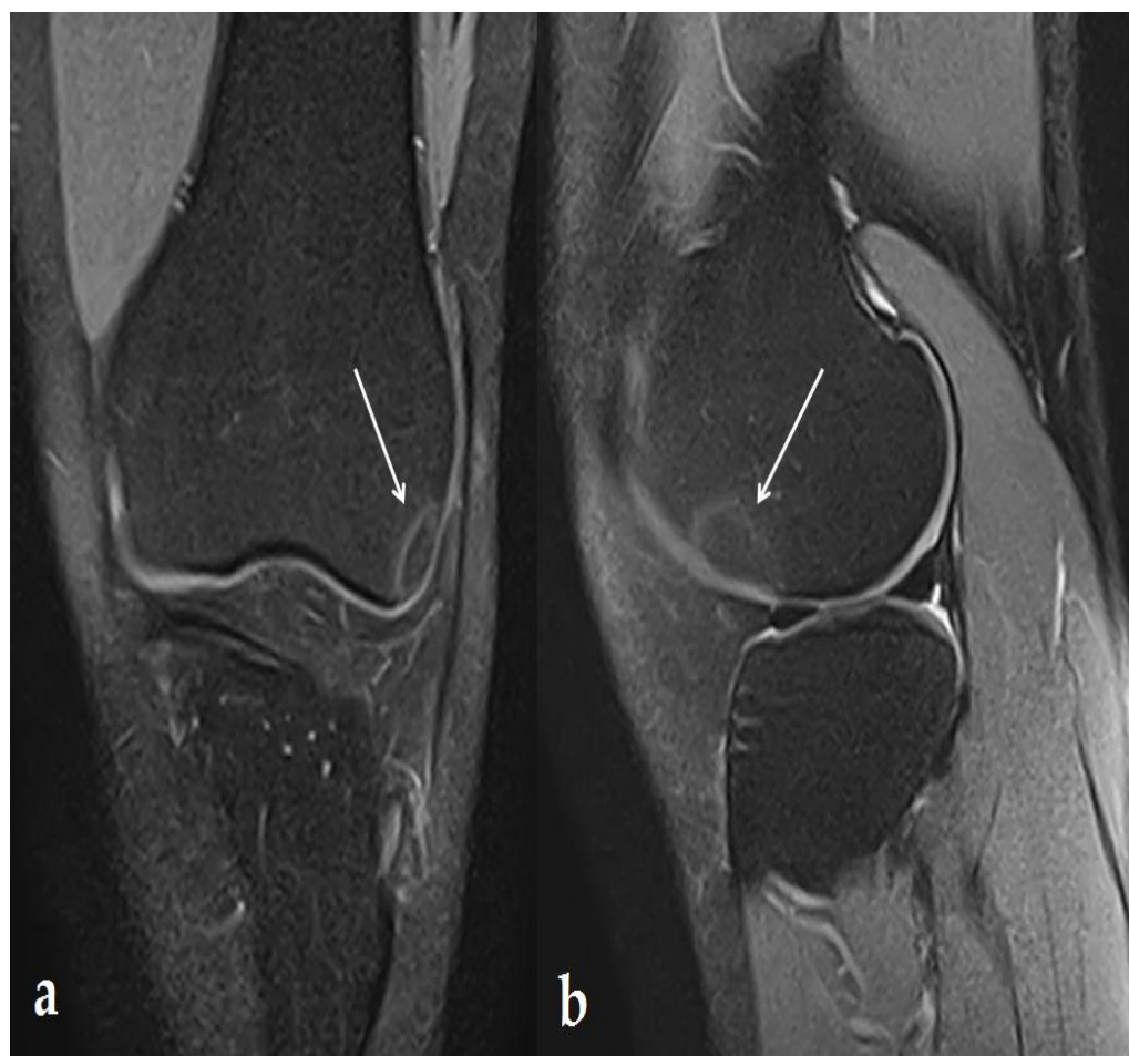
Figure 1. MRI: 1 month before the first US therapy. DP FS MRI image in frontal (a) and sagittal (b) section demonstrating a single ( 13 \times 14 \times 16 mm) lesion under the epiphyseal cortex of the lateral femoral condyle with peripheral border in hyper-intensity, highlighted with white arrows.

The patient was a 21-year-old Caucasian woman with no particular family, medical, or psychosocial history. She had been complaining for two months of pain on exertion in the context of tendinopathy of the ITB syndrome type secondary to practicing indoor exercise (musculature, cross-fit, ...). On clinical examination, she presented no pain on palpation over the knee except for the lateral knee ITB area, no limitation of mobility, and no patellar shock or instability of the knee. The patient had never received corticosteroids either systemically or locally. An MRI was performed one month before the US therapy, which identified a bone reaction in regard to the ITB limited to the lateral facet of the lateral femoral condyle (Figure 1).