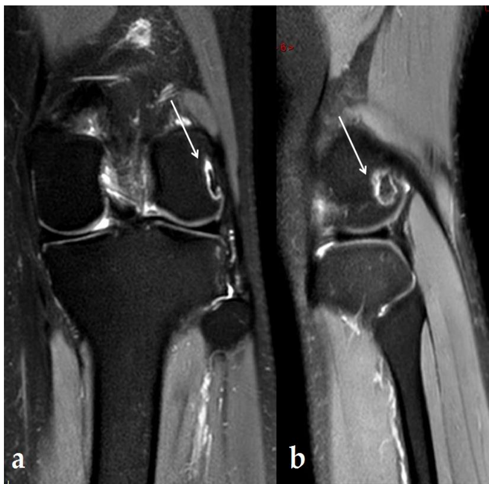
Figure 5. MRI: 11 months after the last US therapy. DP FS MRI image in frontal (a) and sagittal (b) sections showing remaining bone abnormality. At the last follow-up, only a single lesion persisted on the femur of 8 \times 9 \times 5 mm. arrows show lesion.