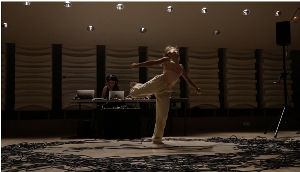
Figure 4: PART 3 - "The musical body": The dancer becomes a living synthesizer. She regains control of her body and uses it to create live music.

qualities of embodied exploration of sound spaces as she navigates them through her movements under the guidance of the musician.