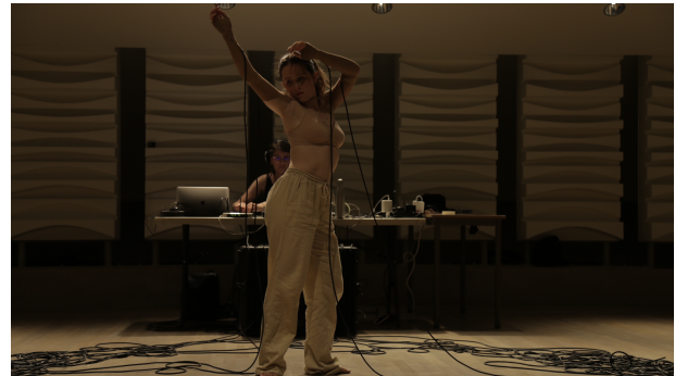
Figure 2: PART 1 - "Awakening": The dancer, (falsely) wired to electrical connections, realizes the power of her body over the music and completely loses control of it. Her movements gradually distort the music until it is completely erased, giving way to the sounds of the body liberated from the wires.

PRELUDE is a 20-minutes live dance/music performance where the dancer M.B. produces sounds in real-time through her movements. The piece unfolds in three parts illustrated in Fig. 2, Fig. 3 and Fig. 4. Supplementary materials and videos are available online 11 .