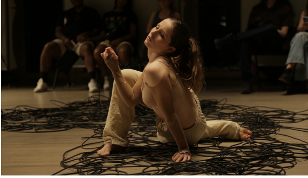
Figure 3: PART 2 - "Introspection": The dancer discovers and explores the sounds produced by her movements. Carefully listening to each part of her body, she embraces this new musical body and begins to build her instrument.