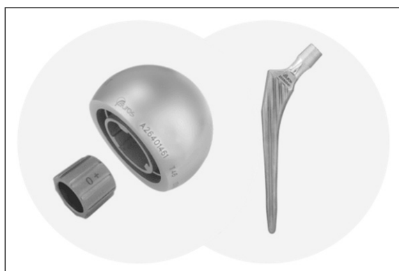
Figure 2. Picture of the ONE HEAD modular unipolar cephalic implant (Left) and PLM stem (Right).