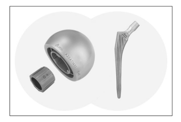
Figure 2. Picture of the ONE HEAD modular unipolar cephalic implant (Left) and PLM stem (Right).