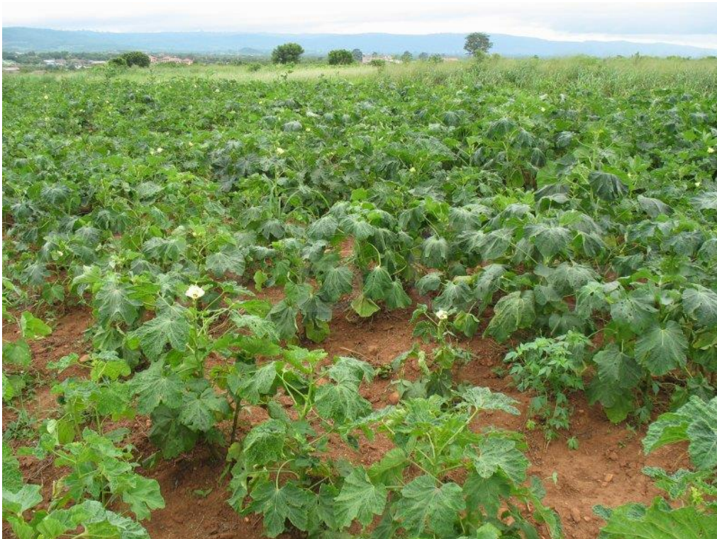
Fig. 1. Abelmoschus esculentus (L.) Moench

The study was design to determine the effect of okra on human development and its impact on the economy of farmers in Obubra rainforest zone of southern Nigeria.