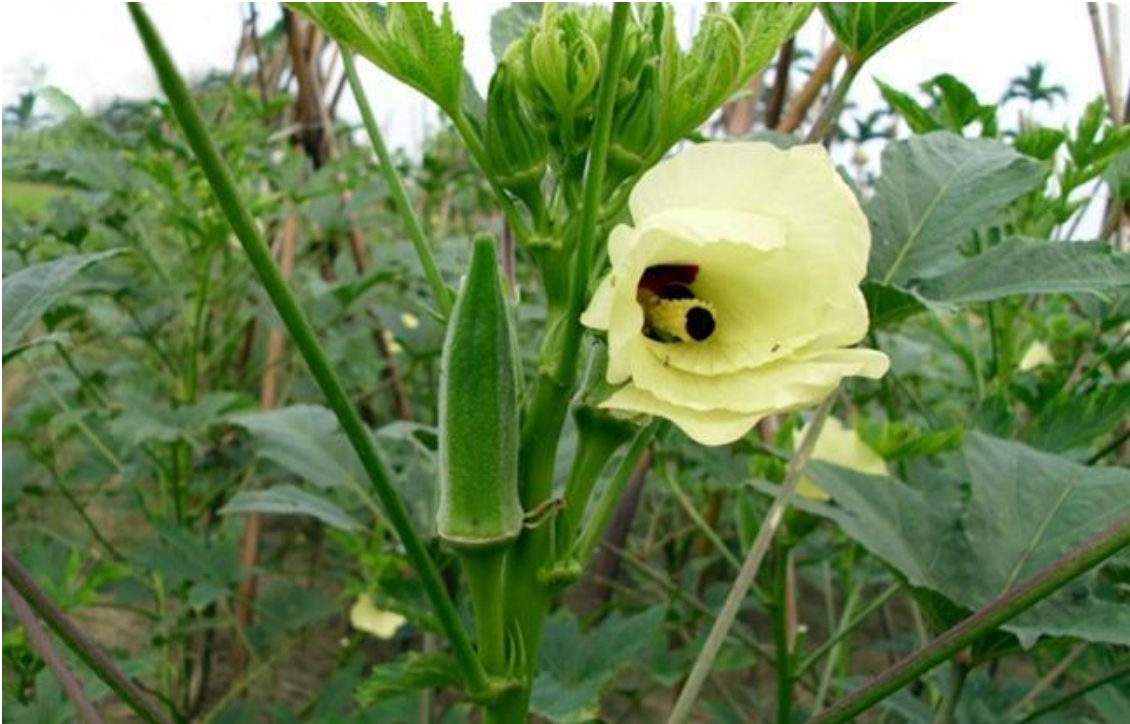
Fig. 2. Abelmoschus esculentus (L.) Moench